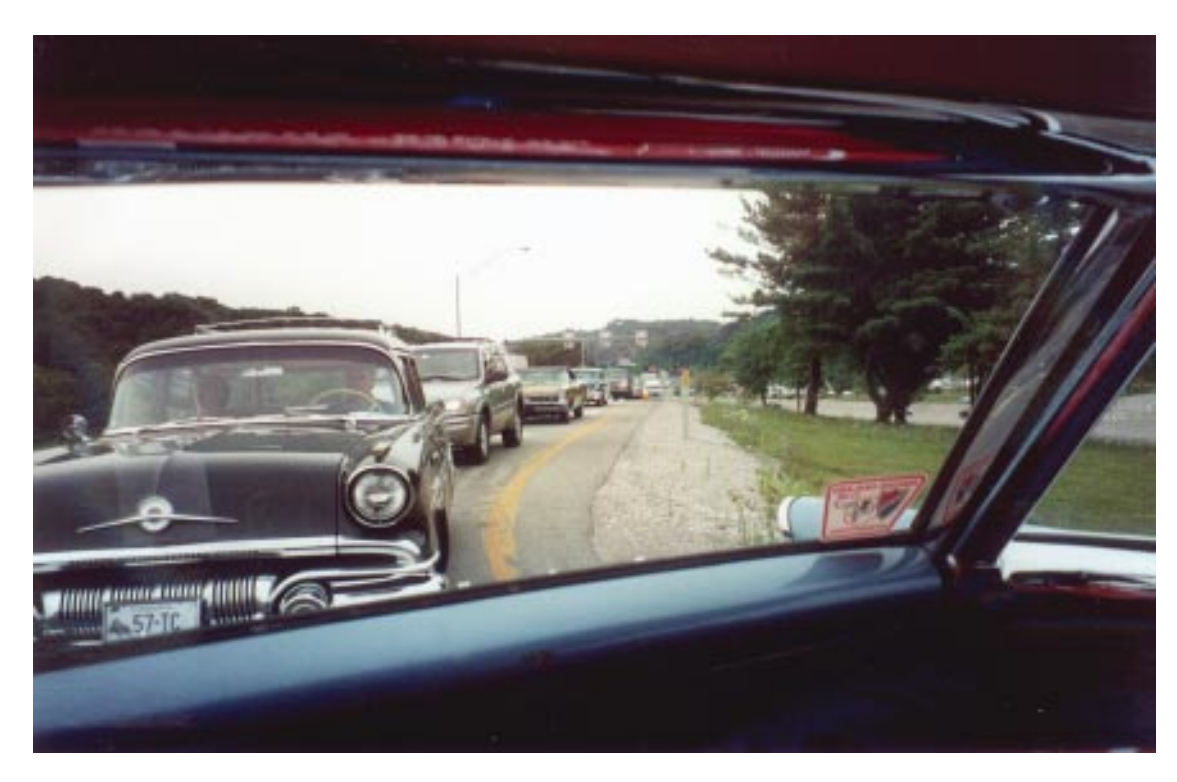
Top: The Breakfast Cruise to the Cracker Barrel, 9 miles from the Convention Center, was lead by the Evans' followed by a caravan of Custom Safari Chapter members. Bottom: The four Safaris that made the Cruise line up in the Cracker Barrel parking lot.