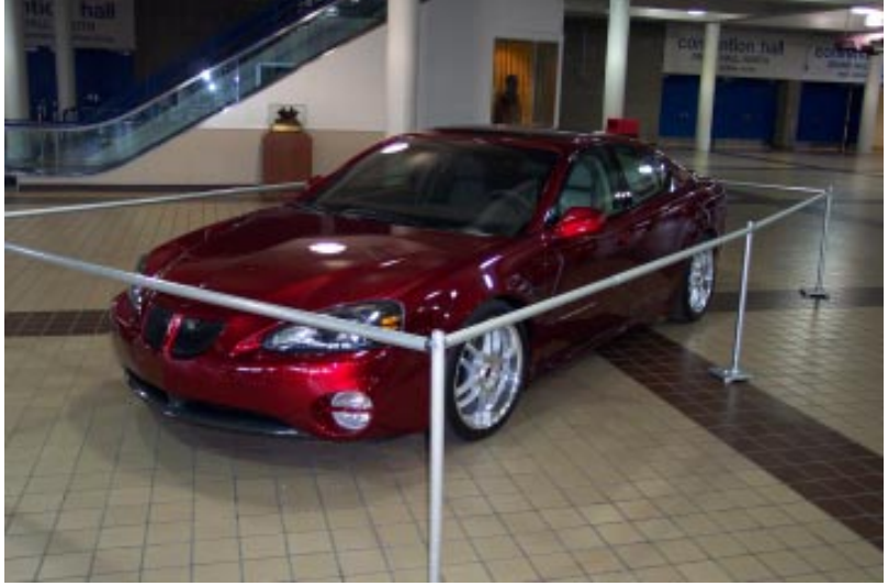
Left: 2004 Grand Prix. This concept car is about 90% of what the actual GP will look like.