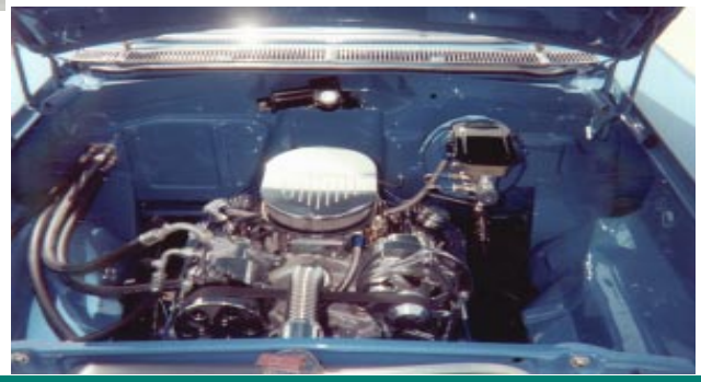
Right: Showing off some of his "Custom" engine work.