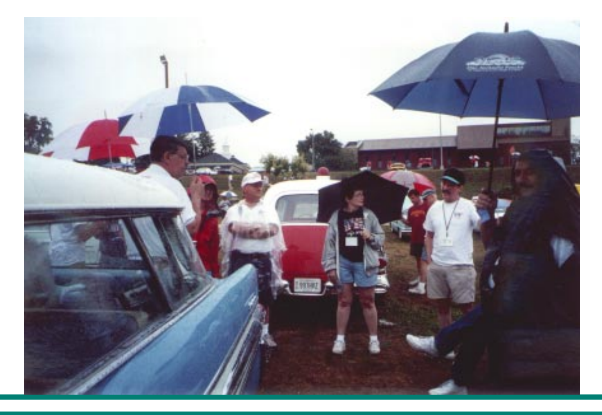
Brave members of the Custom Safari Chapter get together for the Chapter Meeting on the day of the show amongst the Safaris.