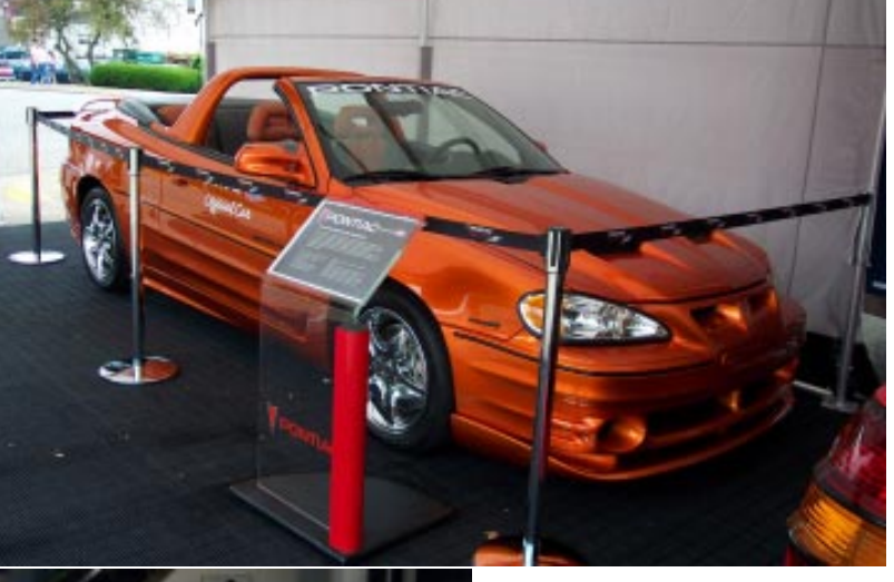
Right: I actually forgot to find out what this car was, but I thought it looked pretty neat.