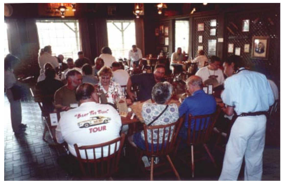
Top and Bottom: Custom Safari Chapter members get together in mass to talk Pontiacs and eat some good food at the Craker Barrel.